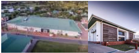
VIMAL CLOTHING & KITCHEN CLASSICS BUILDING

Below are a few references of some of our most memorial projects with key client details.