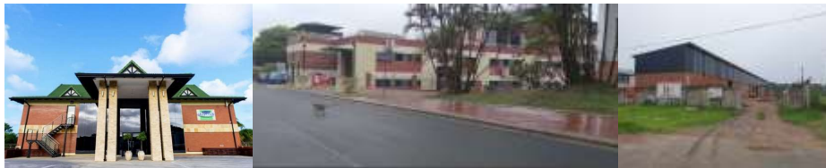
SIYAKA IMPERIAL BUILDING AND WAREHOUSE