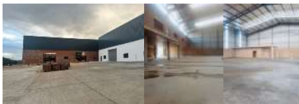
UBS WAREHOUSE AND STORAGE