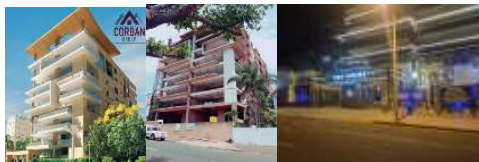
317 CURRIE ROAD HIGHRISE BUILDING